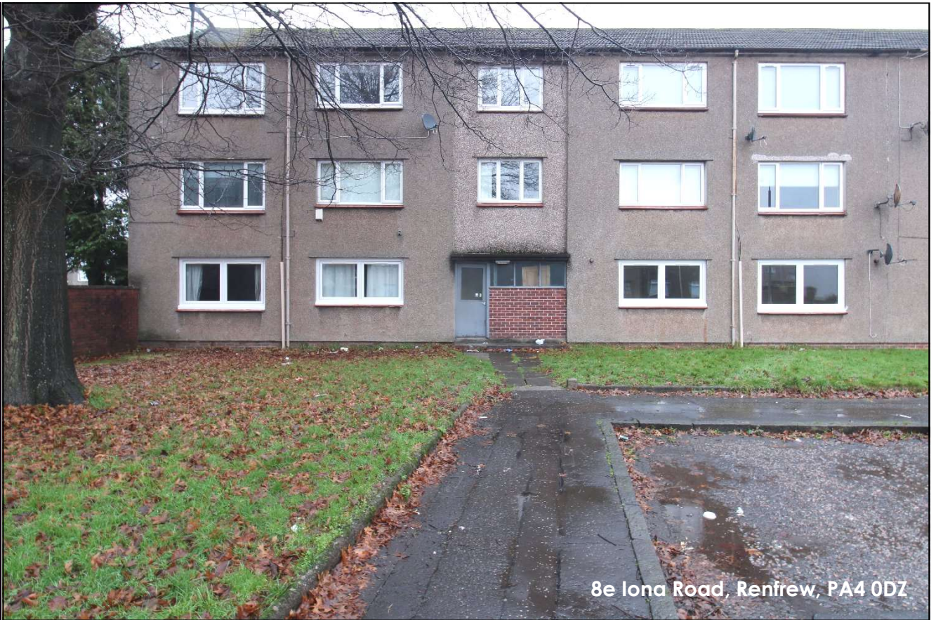
8e Iona Road, Renfrew, PA4 0DZ

This top floor property is ideally positioned in a cul de sac close to many Renfrew amenities and will be ideal for first time buyers or an excellent addition to a buy to let portfolio